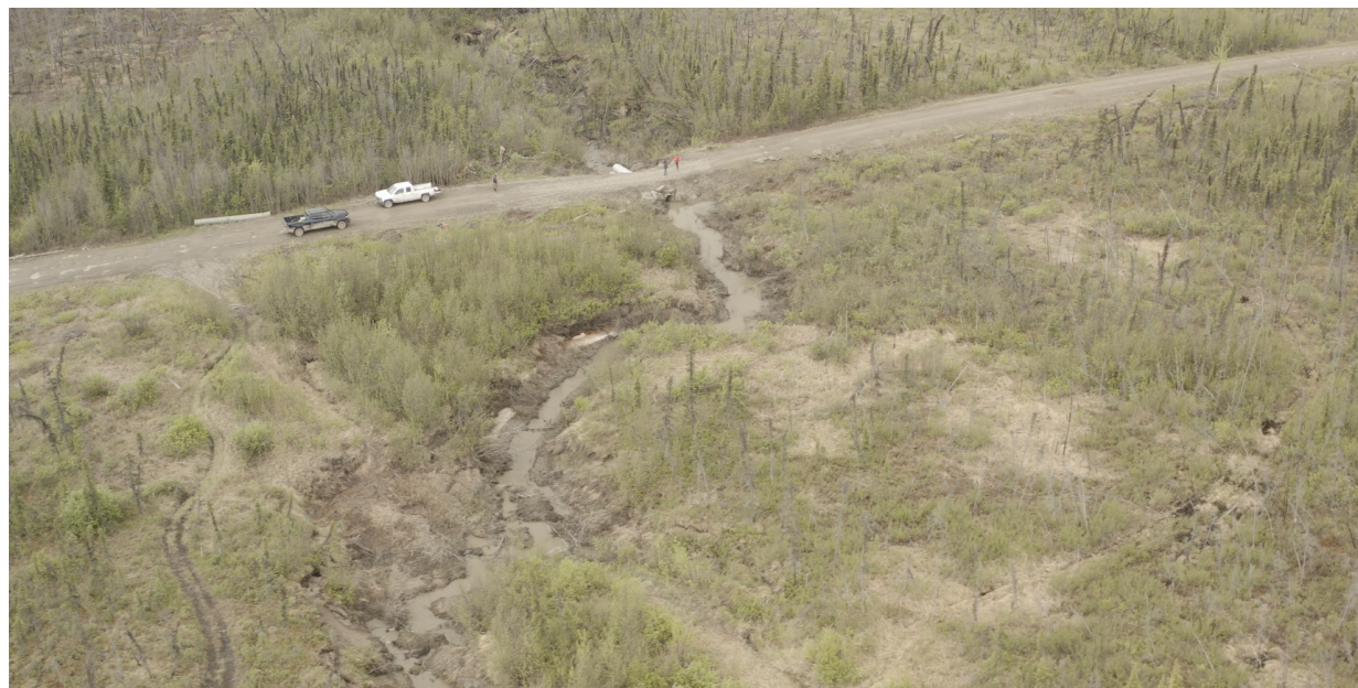
Figure 7. South Facing View of the Project Area in Early Summer