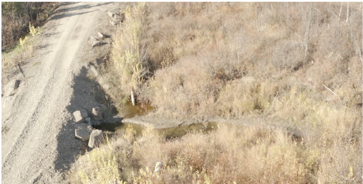
Figure 5. Culvert After Annual Temporary Repair