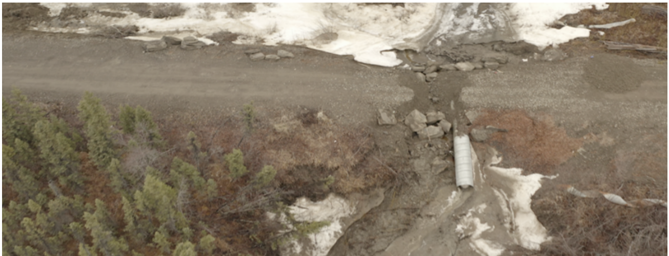
Figure 3. Beginning of Road Wash Out at Main Culvert