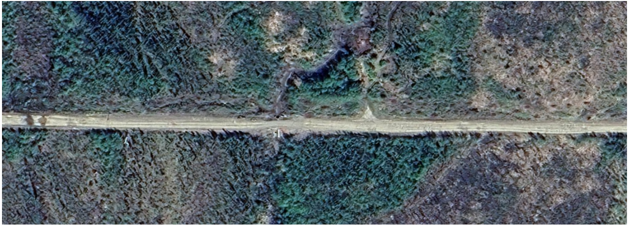
Figure 2. Project Location