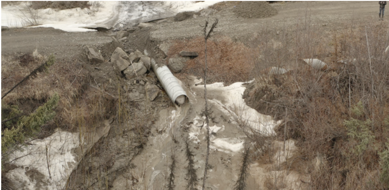
Figure 4. Washout Accelerating (Full flooding and washout not shown)