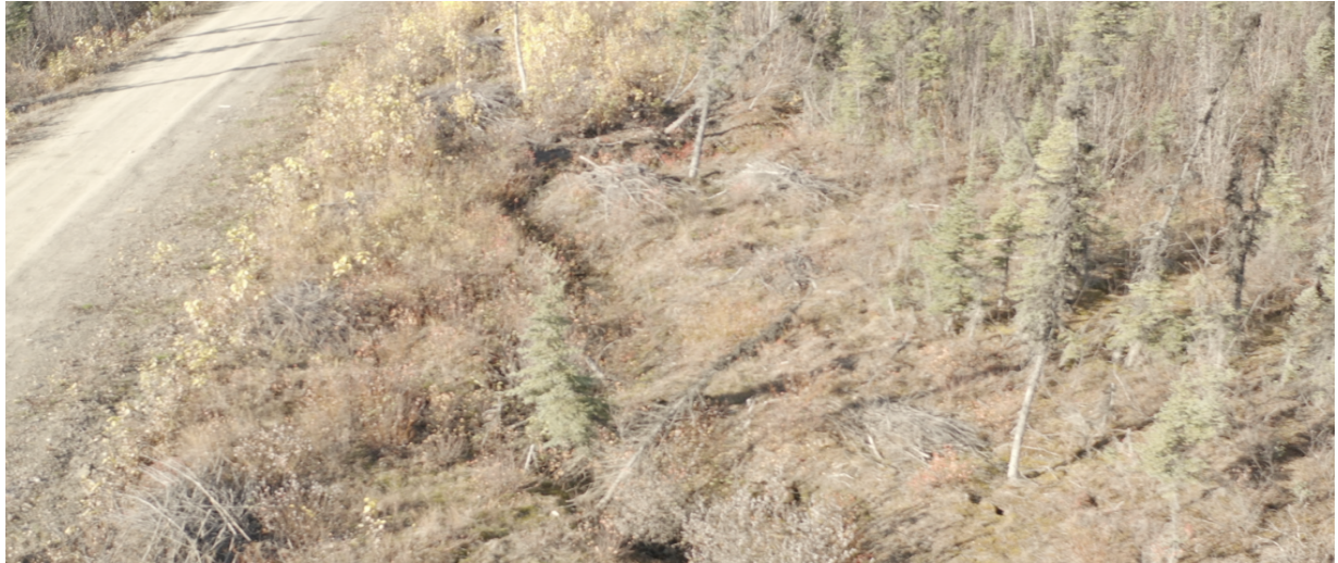
Figure 6. Small Drainage/Thermokarsting on North Side of Road